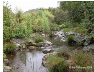
Alameda Creek, Sunol Regional Park