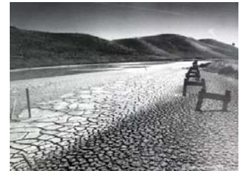
Alameda Creek, Coyote Hills Regional Park